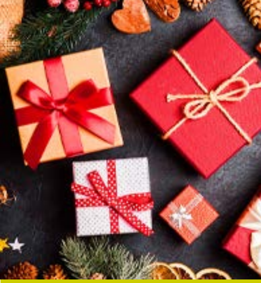
Gifting land - is it that easy?