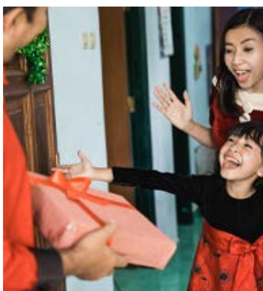
Seeing my child at Christmas